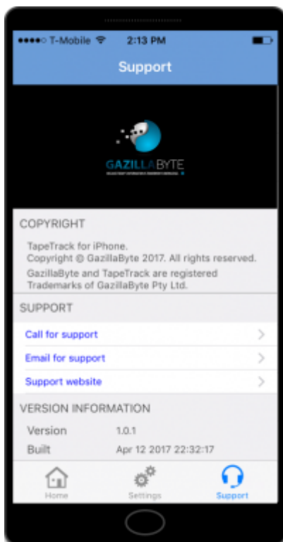
The support screen will give you 3 options.