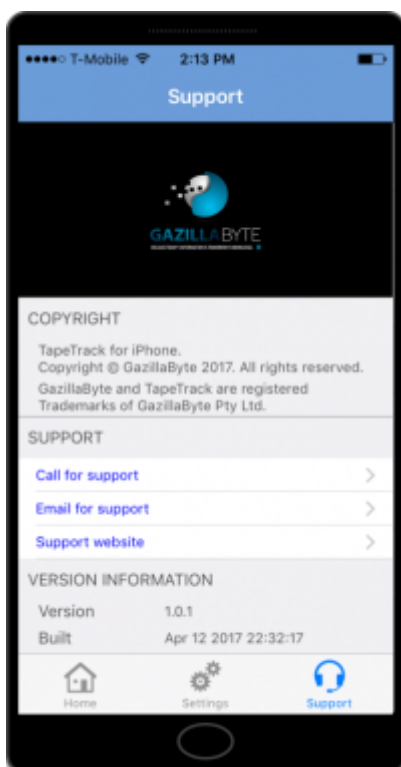
The support screen will give you 3 options.